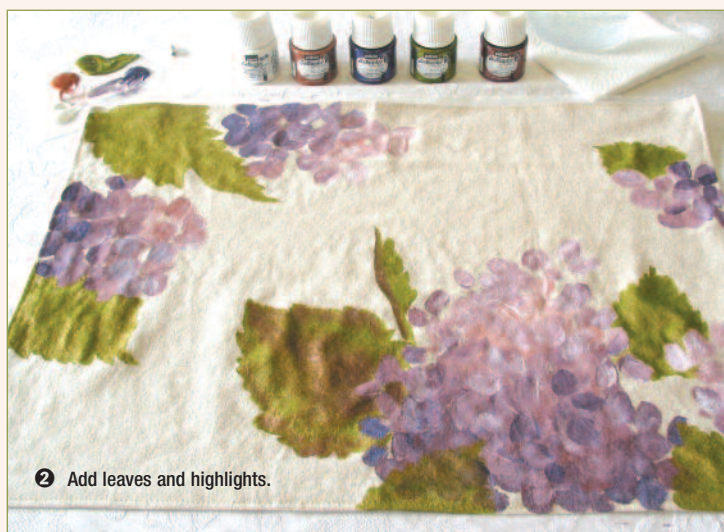
2 Add leaves and highlights.