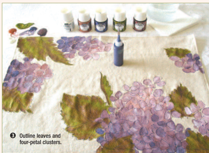
3 Outline leaves and four-petal clusters.

Finally, paint just a few blossoms in white with a dab of lavender. This gives the flowers a graduated effect, with the darkest shades on the outside and the lighter shades toward the center of the place mat (1).