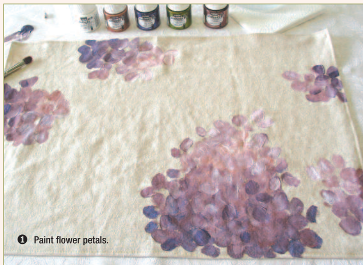
1 Paint flower petals.

tip: When using an applicator bottle for the first time, practice on a paper towel to get the feel for it. Squeeze gently to start the paint flowing.