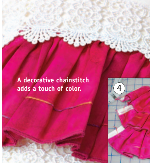
A decorative chainstitch adds a touch of color.